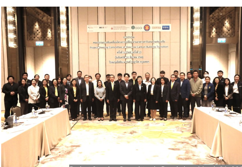
Project Steering Committee in Bangkok on March 31, 2025.

Establishing Financial Pathways: A Carbon Trust survey is currently being translated into Thai and will be shared with banks, energy institutions, and policymakers, along with one-on-one interviews. Insights gathered will inform the development of a study assessing market readiness for Energy Service Companies and on-bill financing mechanisms.