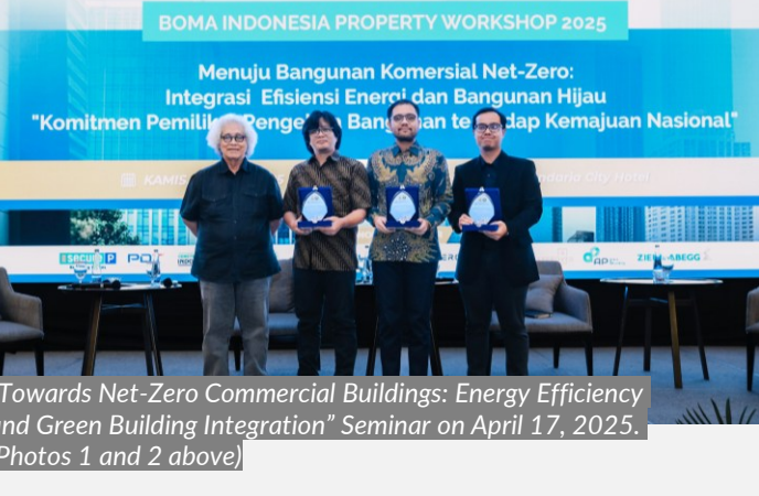
"Towards Net-Zero Commercial Buildings: Energy Efficiency and Green Building Integration" Seminar on April 17, 2025. (Photos 1 and 2 above)

Subnational Building Assessment: Preparatory work is underway in Jakarta and Semarang, following consultations with local government agencies to support upcoming assessments.