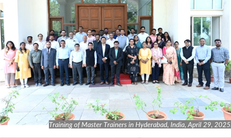
Training of Master Trainers in Hyderabad, India, April 29, 2025.

TAC and PSC Update: The 5th TAC meeting is scheduled for July, and the 1st Project Steering Committee (PSC) meeting is planned for August.