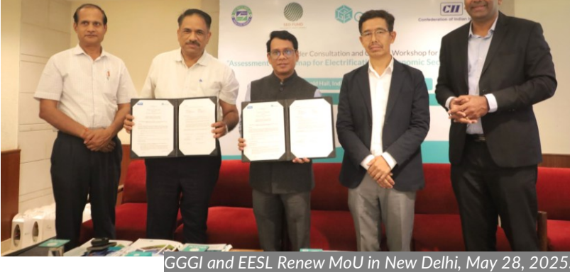
GGGI and EESL Renew MoU in New Delhi, May 28, 2025.