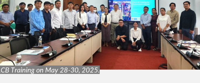
LCB Training on May 28-30, 2025.

Subnational Building Assessment: A deep-dive assessment of 75 has been completed. Data captured on both operational and embodied carbon will be considered into the national baseline and assess data availability for application of the Building Emission Assessment Tool (BEAT).