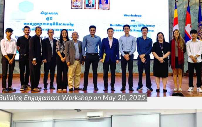
Building Engagement Workshop on May 20, 2025.

Showcasing country and regional updates as we drive sustainable solutions to advance low carbon buildings across Asia.