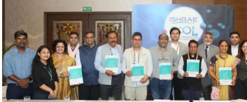
ALCBT-GGGI India at CoOL Conclave by ISHRAE 2025, Indore, August 01, 2025.