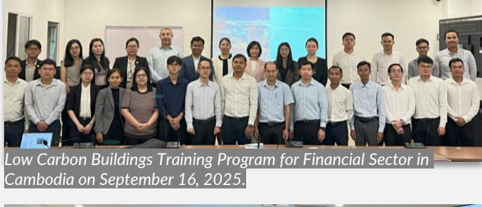
Low Carbon Buildings Training Program for Financial Sector in Cambodia on September 16, 2025.