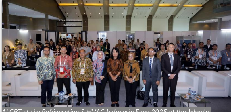
ALCBT at the Refrigeration & HVAC Indonesia Expo 2025 at the Jakarta International Expo, September 24-26, 2025.