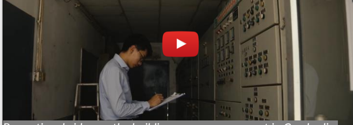
Promotional video on the building energy assessment in Cambodia.