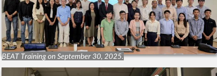
BEAT Training on September 30, 2025.