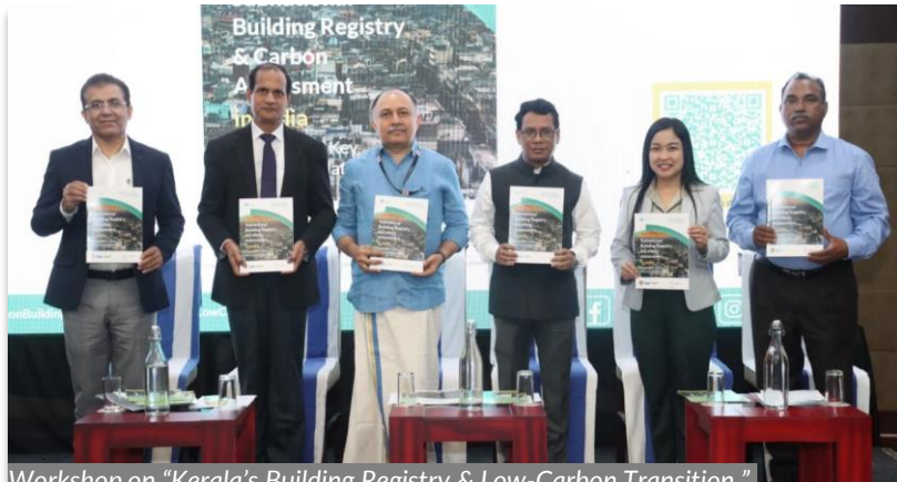
Workshop on "Kerala's Building Registry & Low-Carbon Transition," August 27, 2025.

TAC and PSC Update: The first Project Steering Committee Meeting was held in New Delhi on August 29, and the fifth TAC meeting was held on July 10, both in collaboration with the Bureau of Energy Efficiency, Ministry of Power and the Building Materials and Technology Promotion Council, Ministry of Housing & Urban Affairs.